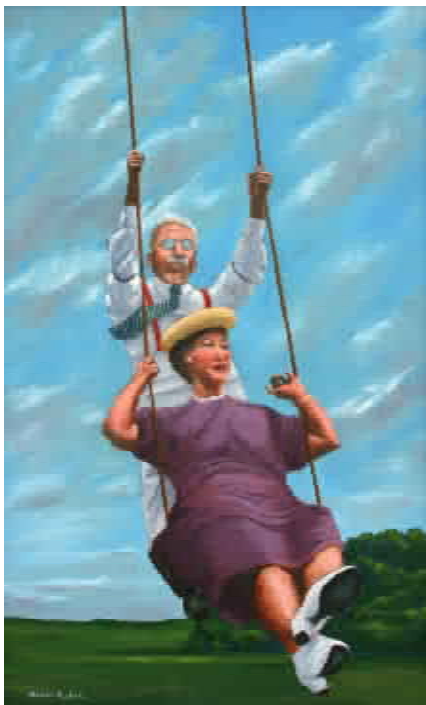
Alan Rubin High Flyer Oil on canvas, 30 x 18